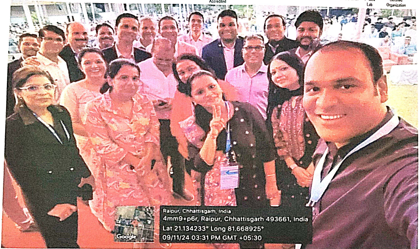
Figure 3 - Stage Selfie with all guests after Panel Discussion