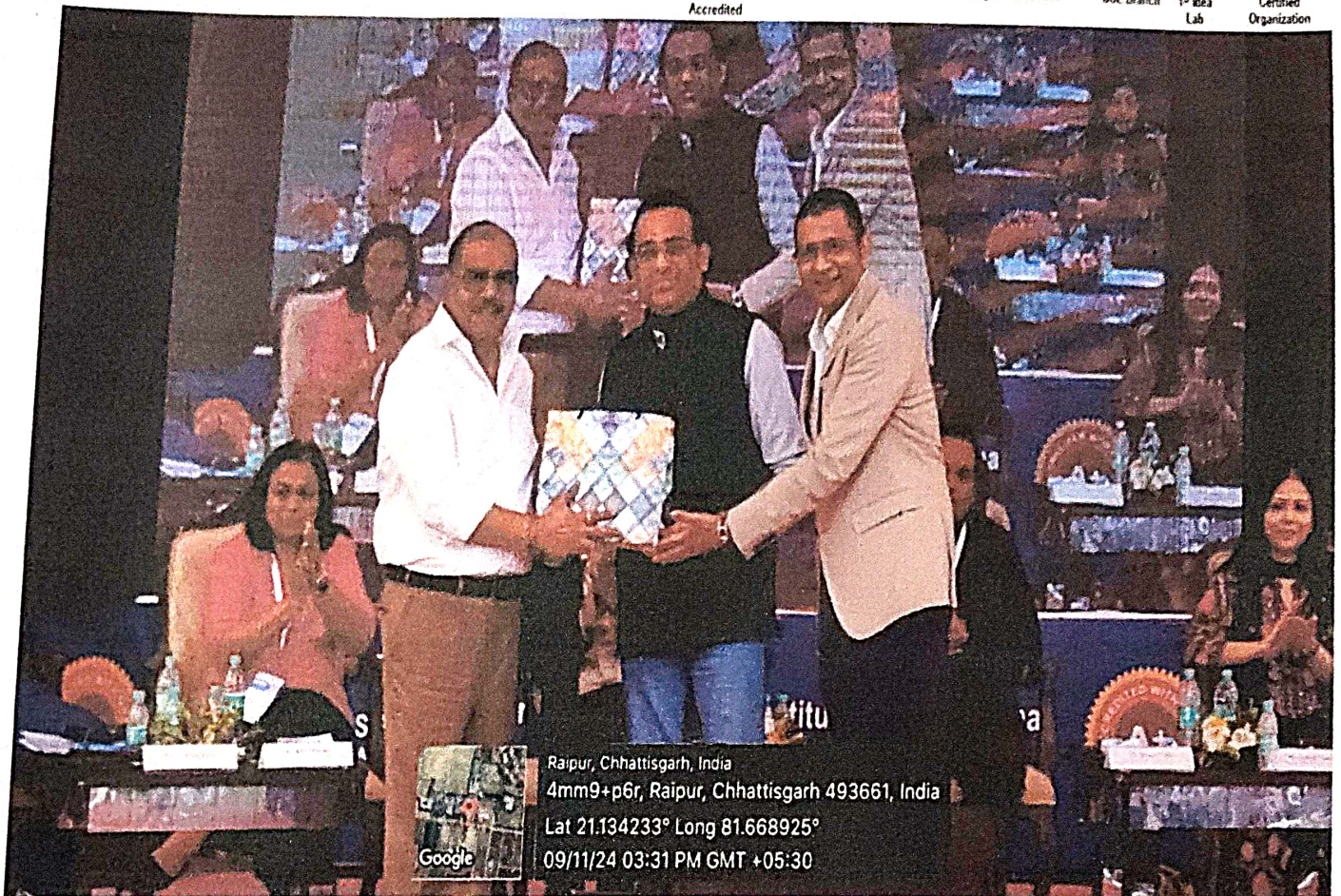
Figure 4 - Momento Giving Ceremony after Panel Discussion