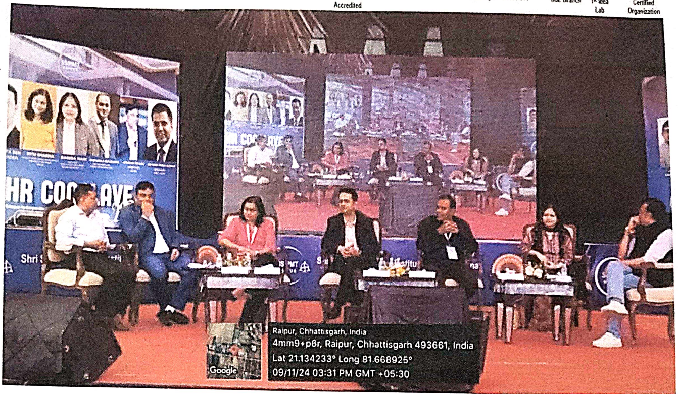
Figure 2- HR Conclave - Panel Discussion